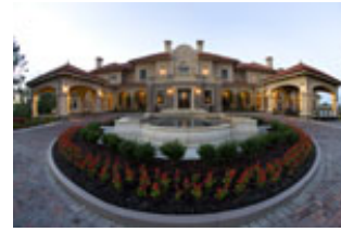
TPC Sawgrass Club