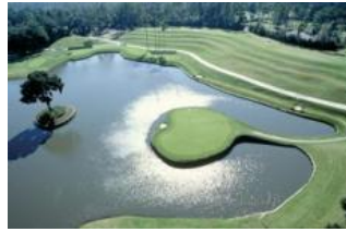
TPC Sawgrass 17 th hole

1000 Sawgrass Village Dr Suite 101 Ponte Vedra Beach, FL 32082 Off: 904-285-1800 ext 3024 Fax: 904-551-0996