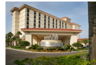
OCEAN ONE Atlantic Beach